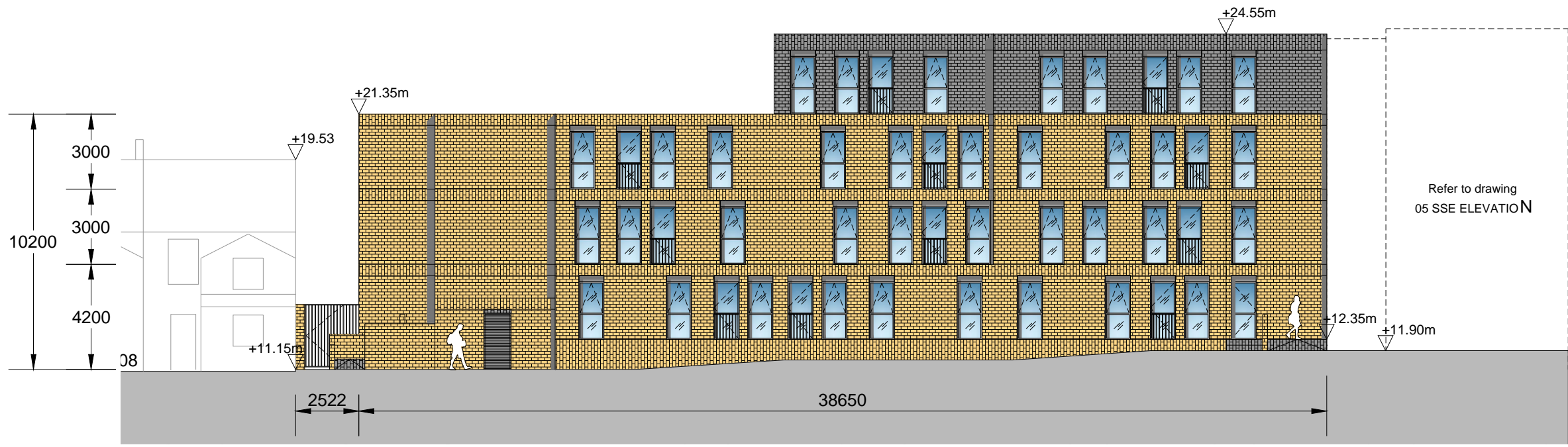
03 North west (Amenity space) Elevation Scale 1:200 @ A3