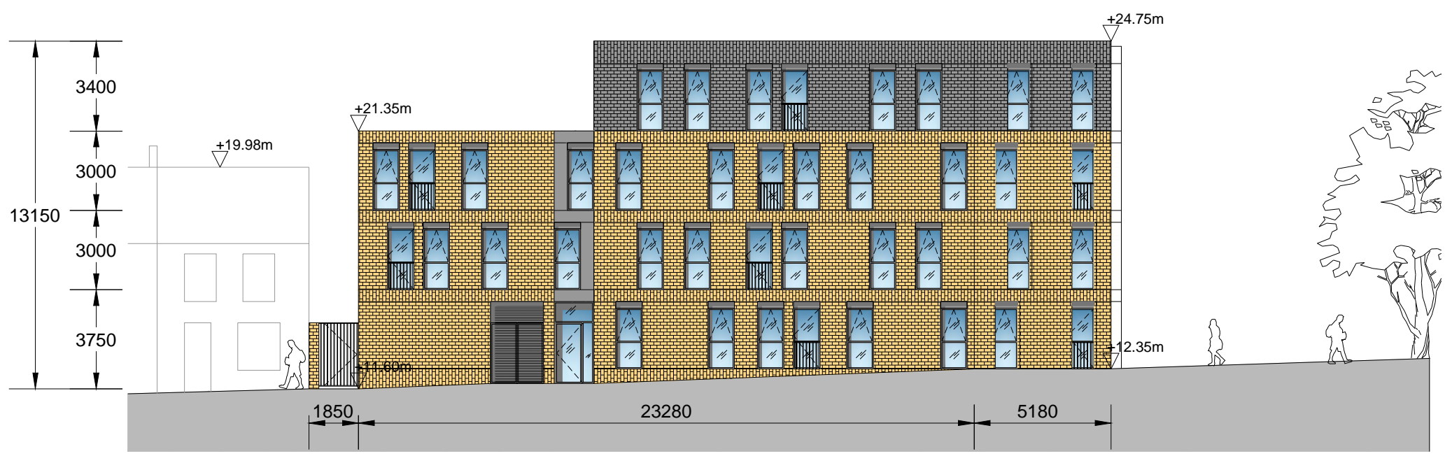
04 South west (Agate St.) Elevation Scale 1:200 @ A3

Notes: * Do not scale from drawing * Not for Construction * For Planning Only