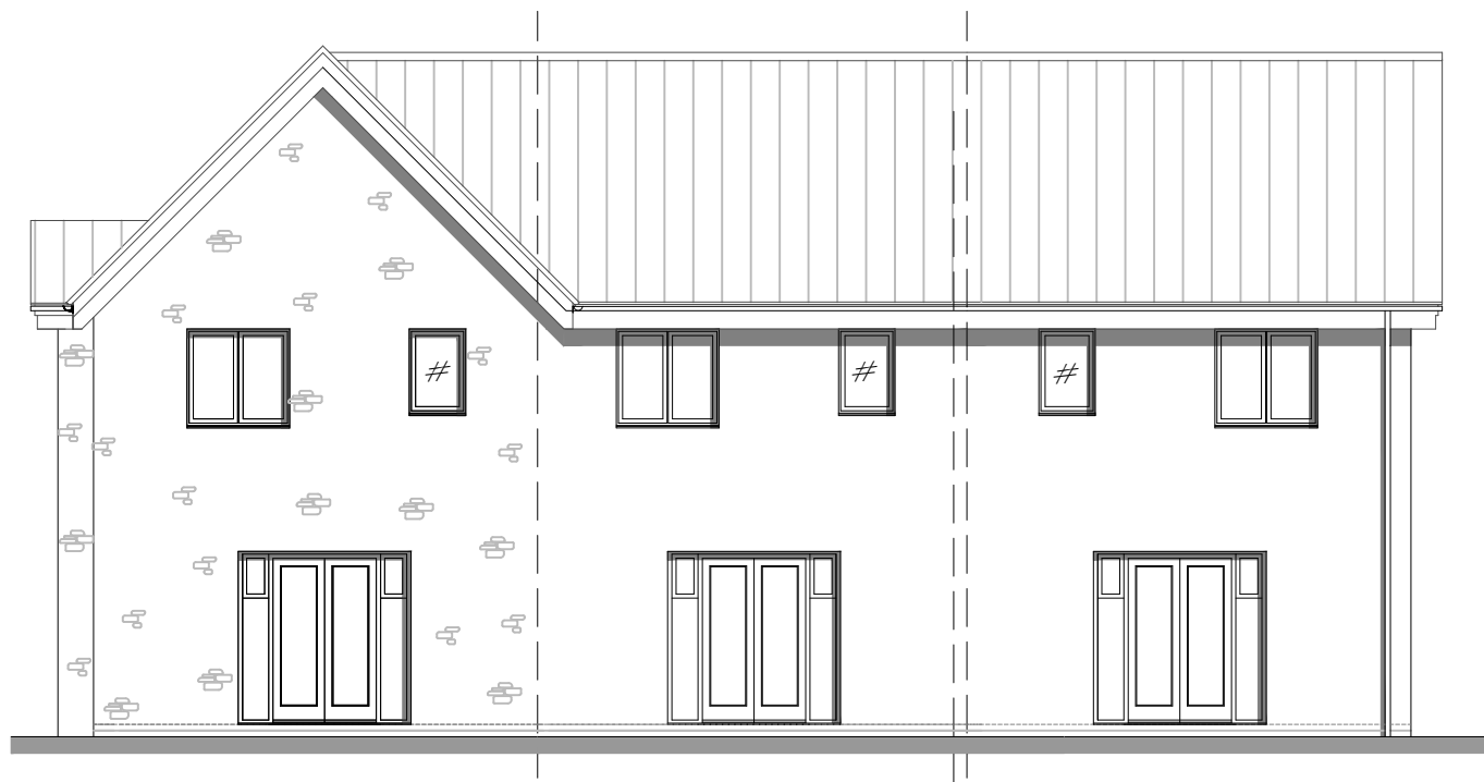
REAR ELEVATION #-Obscure Glazing